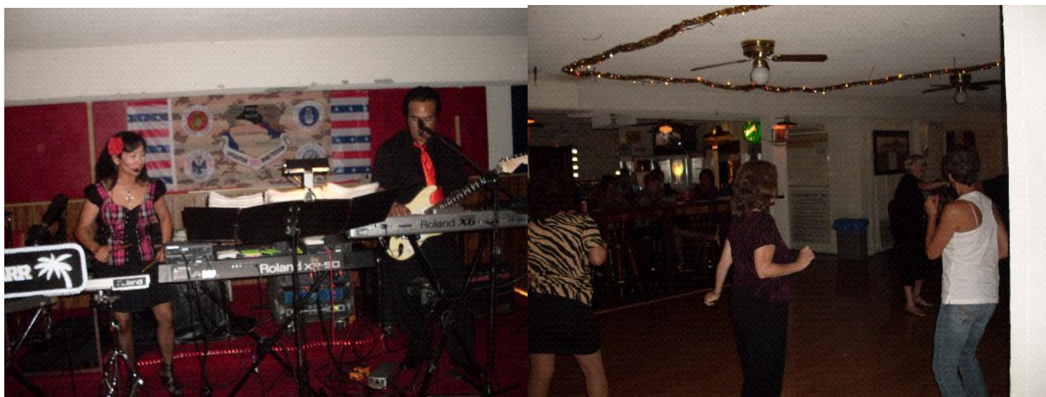
Friday night dances at the post